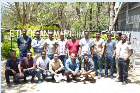
MEML Course 1 Participants

I personally strongly recommended that the upcoming MEML candidates be well prepared before they come to attend the course. If they are onboard or at home, they are to study well to ensure clearing the written and oral exams. Psychologically they are to be well prepared for the next higher ranks as a second or chief engineer.