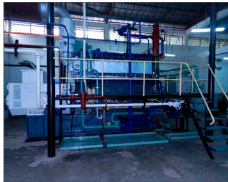
Left Picture: Alumni mechanical engineering cadets who are part of the "on-the-job training programme, at work on the installation of the Gen-Set.